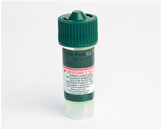
EcoFix Transport Vial